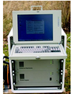
Outdoor unit: pc and electronic