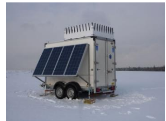
SODAR in trailer with solar panels